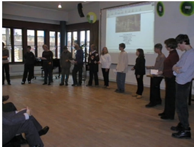
KULTUREN, the Museum of Cultural History in Lund